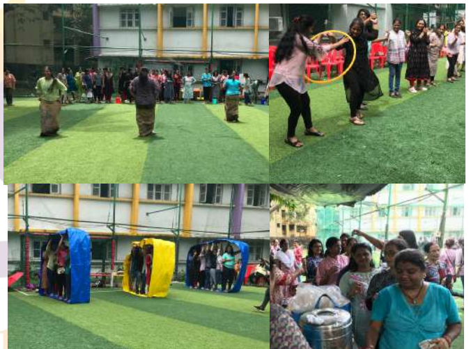
Monsoon Mania Moms