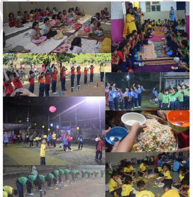
Sleep Over Party