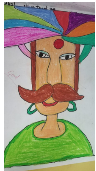
Ananya Gowalkar (Grade 2)