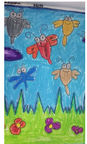
Ananya Gowalkar (Grade 2)