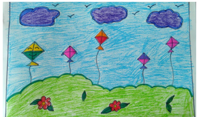
Swara Narkar (Grade 1)