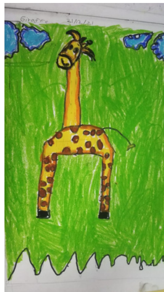
Ananya Gowalkar (Grade 2)