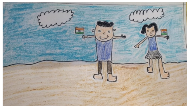
Aadit Nilankar (Grade 1)