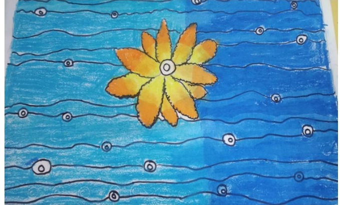
Avani Patgaonkar (Grade 5)