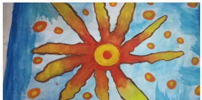
Yash Dhotre (Grade 7)