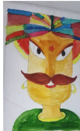
Siddhi Shetye (Grade 5)